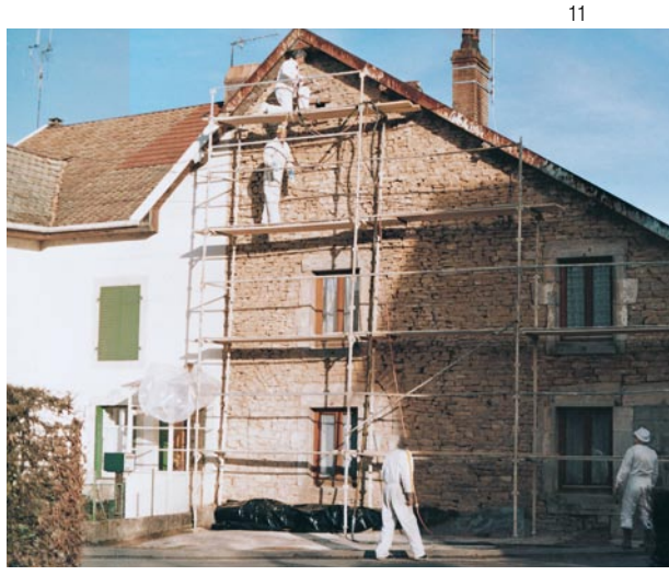
For the SP 5 – currently the strongest 230 V worm pump available on the market – even larger-scale refurbishing jobs present no problems.

207 803.000 207 804.009 207 966.001 207 806.007