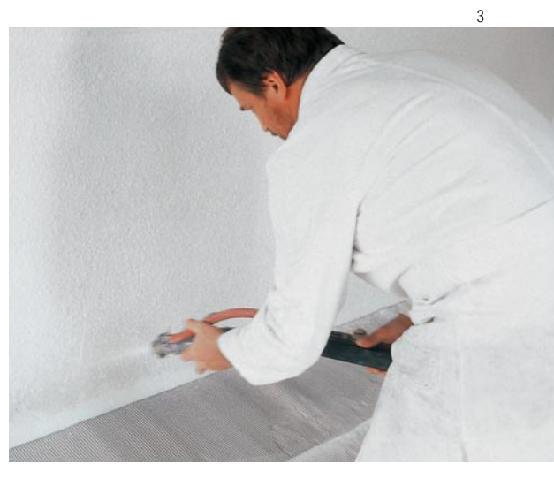
Worm pumps type S 5 and SP 5 can be used for all pumpable mortars up to an aggregate graining of 6 mm, whether as normal base coat plaster (large picture), as a decorative texturing plaster.

This worm pump has a 230 V alternating current drive. Compared with the S 5<sup>EV</sup> the SP 5 has a preinstalled air compressor which is usually adequate for most applications.