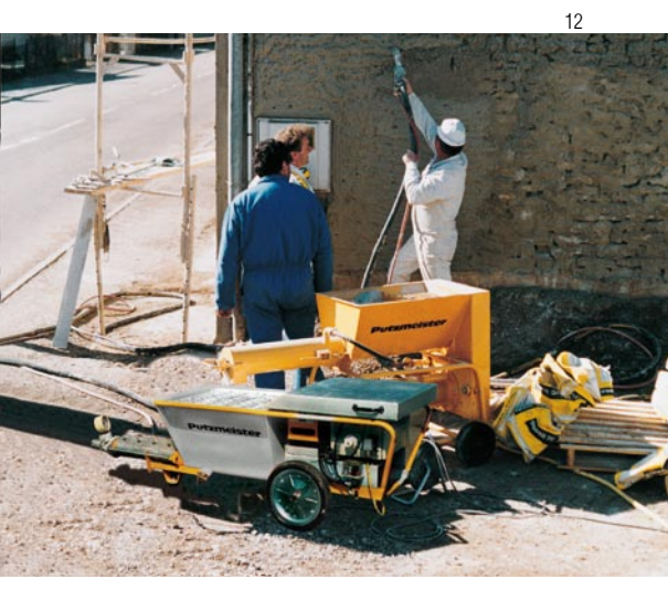
When combined with a continuous mixer (CM 528), the SP 5 performs even better.