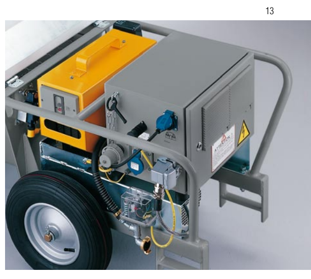
Completely equipped including compressor. You can start work straight away with the SP 5 without the need for an auxiliary compressor.