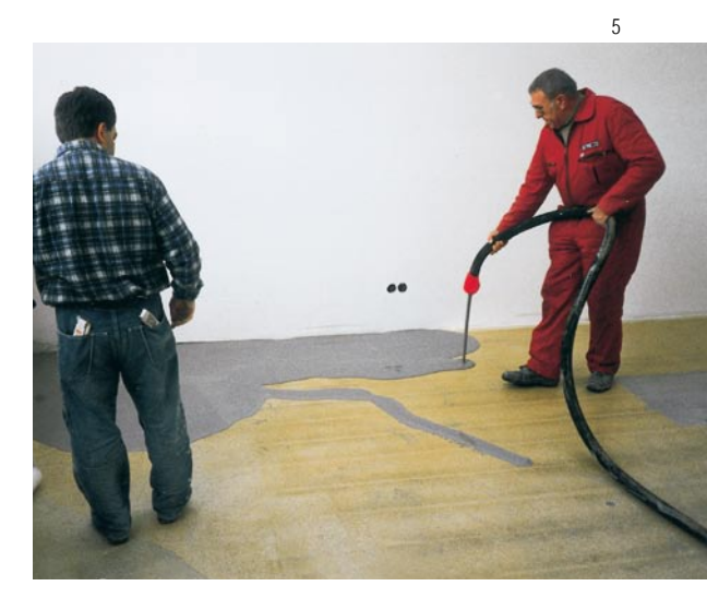
But even liquid cement filler can be worked (here e.g. with an S 5<sup>™</sup> in a production hall).